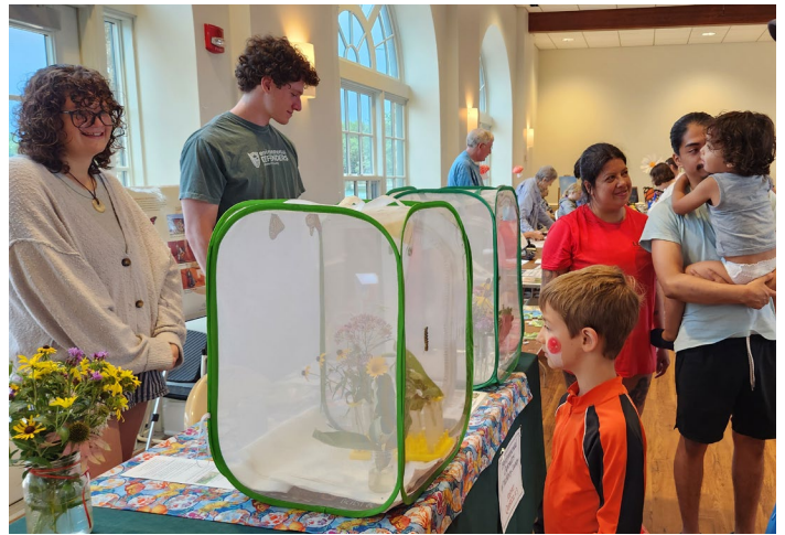
2025 Monarch Mania Fair

Monarch Pledge, our county has responded with enthusiasm. We are pleased to report that 19 units of government have taken the 2026 pledge. That represents over a third of ALL pledges from Illinois. Thank you to Village of Algonquin, Coral Township, City of Crystal Lake, Crystal Lake Park District, City of Harvard, Village of Hebron, Village of Island Lake, Village of Johnsburg, Village of Lake in the Hills, Village of Lakemoor, City of Marengo, Village of Oakwood Hills, Village of Port Barrington, Village of Richmond, Village of Spring Grove, Village of Trout Valley, Village of Union, Village of Wonder Lake and City of Woodstock.