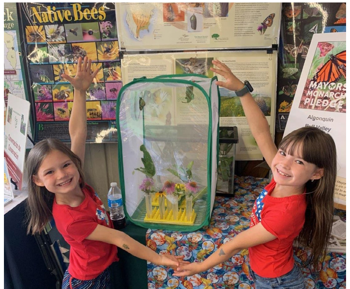
Monarch education at the McHenry County Fair