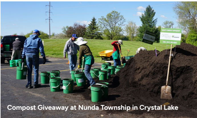
Compost Giveaway at Nunda Township in Crystal Lake

The Waste Reduction Team has jumped into summer with enthusiasm and momentum! We kicked off the season with our first-ever Compost Giveaway, held in partnership with the University of Illinois Extension Office. The event was a tremendous success, with more than 250 participants attending both locations. Community members were incredibly appreciative, and the event provided a wonderful opportunity to connect with residents and share the mission of the Defenders.