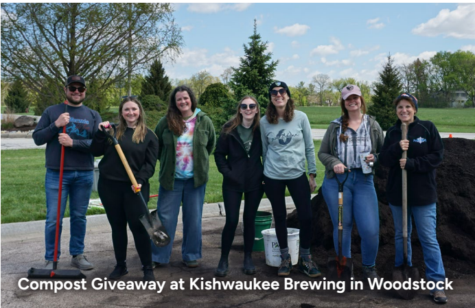
Compost Giveaway at Kishwaukee Brewing in Woodstock