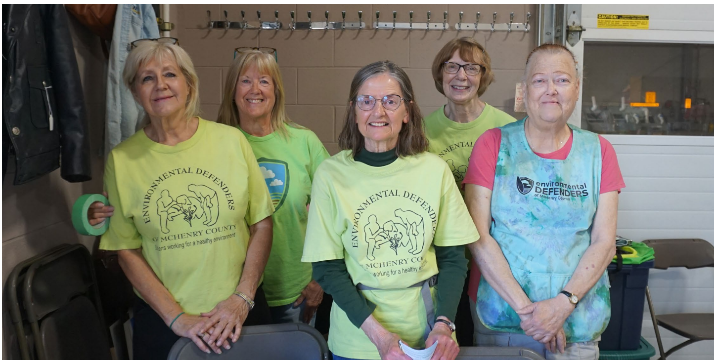
Volunteers preparing for the Garage Sale opening