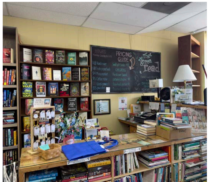
The Green Read in Downtown Crystal Lake

Facebook: The Green Read | The Green Spot Used Books and More Instagram: @thegreenbookstores