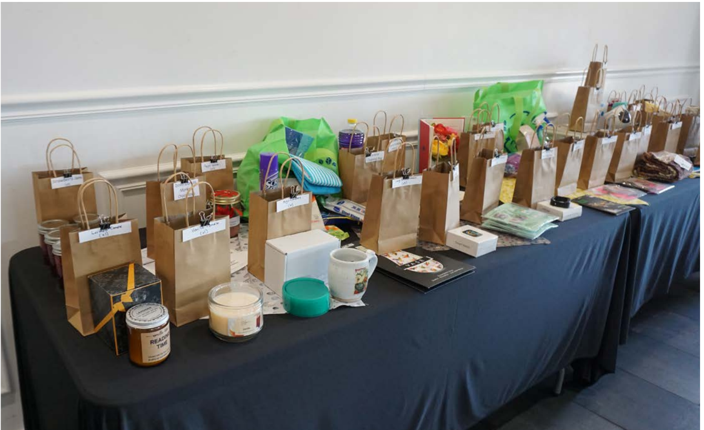
Bag Raffle at 2026 Annual Meeting

The Environmental Defenders of McHenry County Board, Staff, and Fundraising Action Team