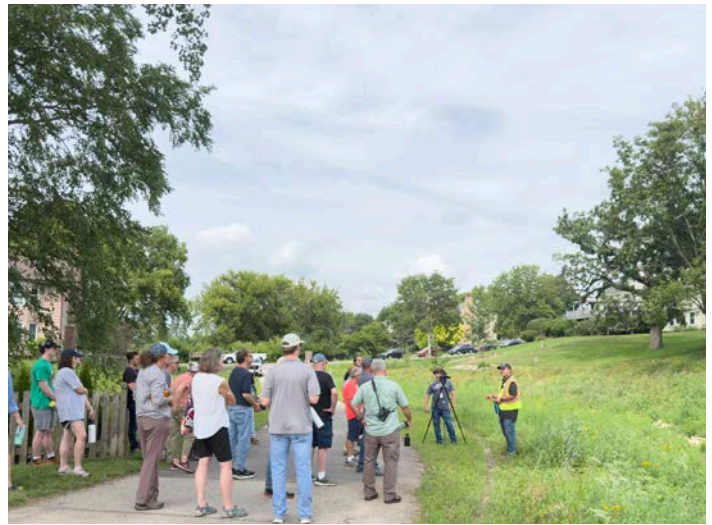
Dixie Creek in July 2025

Details about each upcoming program and any additional events will be shared in our weekly eNews. Please watch updates to stay informed about opportunities to learn and participate. You can also sign up to receive notices of future BMP Talks & Tours at tinyurl.com/BMPTourSignup .