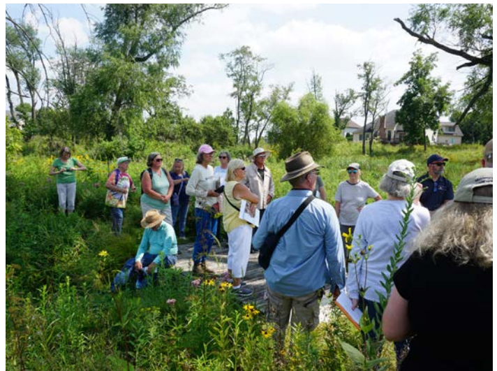
Boloria Meadows in June 2025