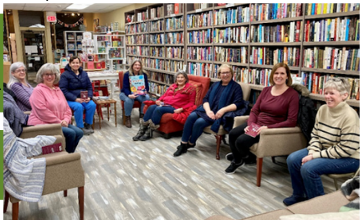
RIGHT: THE GREEN READERS BOOK CLUB AT THEIR FEBRUARY MEETING AT THE GREEN READ.