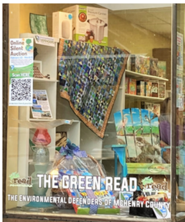
LEFT: ITEMS IN THE ONLINE SILENT AUCTION WERE DISPLAYED IN THE FRONT WINDOW OF THE GREEN READ BEFORE THE DEFENDERS’ ANNUAL MEETING IN MARCH.

The warmer weather means the Farmers Market will be moving back to the Woodstock Square on Tuesdays and Saturdays. Stop by the Green Spot and say hi if you’re on the square. You may even find one of us handing out promotional coupons at the Saturday Market! Please help us spread the word about our bookstores. If you are active on social media, please follow and “like” both of the stores on Facebook and share our posts with your family and friends. Many thanks!