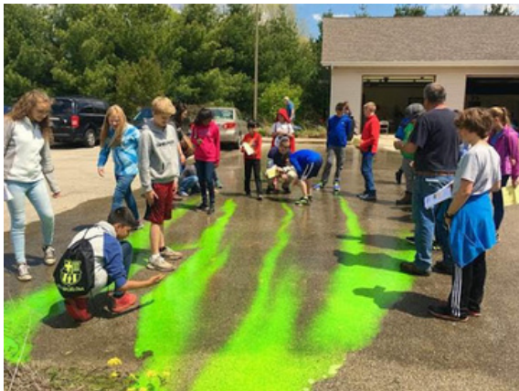
LEFT: WATER POLLUTION BEING DEMONSTRATED