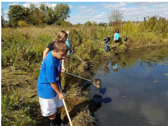
LEFT: STUDENTS SAMPLE SURFACE WATER FOR MACROINVERTEBRATES